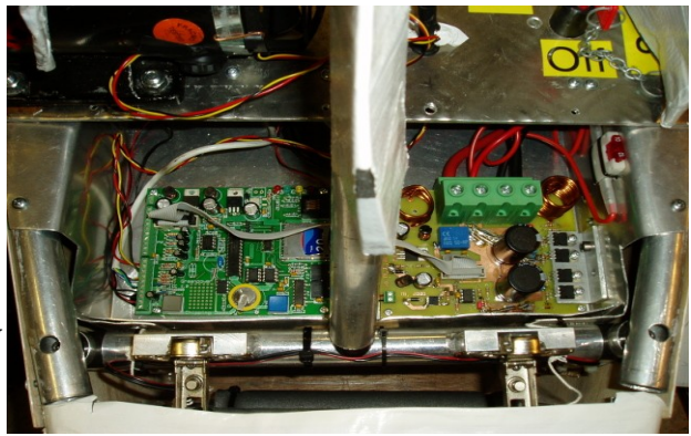
Illustration 2: Electronics in Rotary Racer